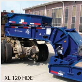
XL 120 HDE

7 position variable ride height makes hooking up to the truck easy. The different axle configurations , main deck widths, lengths and heights along with the ability to add a booster , provide superior versatility.