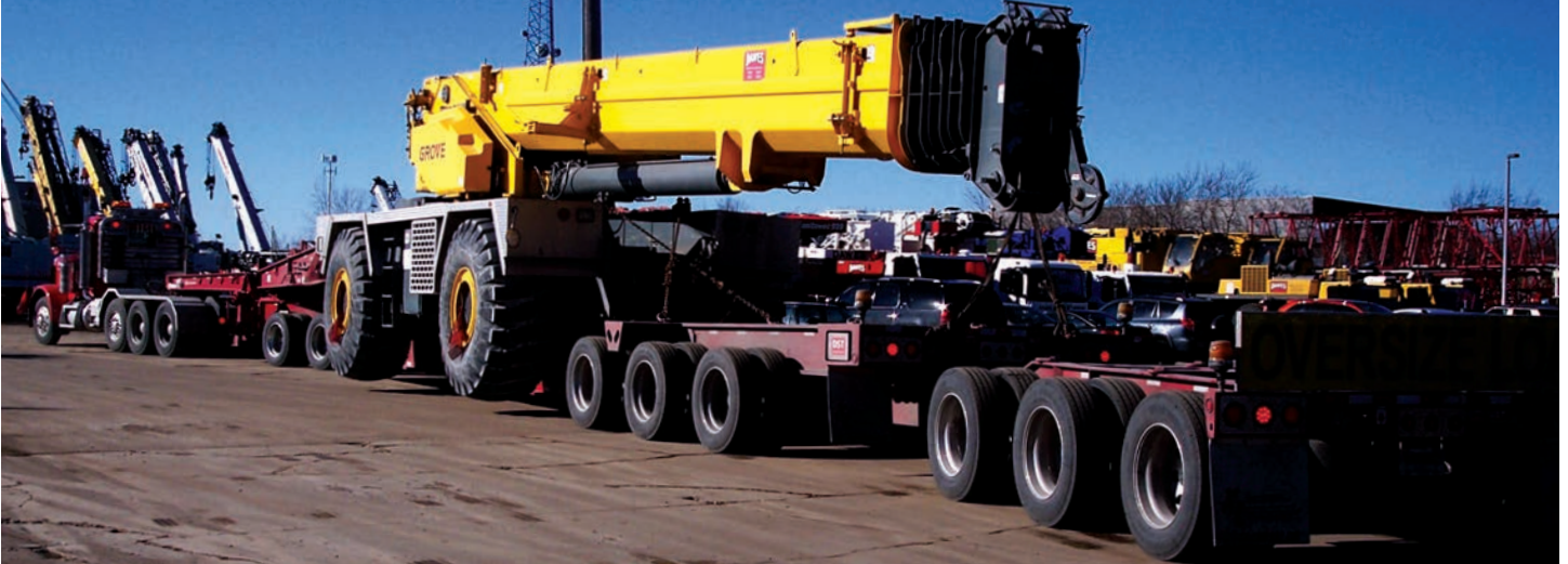
XL 150 Hydraulic Detachable Gooseneck 3+3+3 beam deck