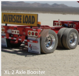
XL 2 Axle Booster