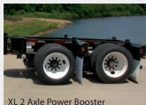
XL 2 Axle Power Booster