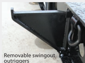
Removable swingout outriggers