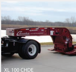
XL 100 CHDE

XL hydraulic necks are wider and stronger than the industry standard, offering increased stability for high center of gravity loads. The hydraulic support arm contacts truck frame rails only; there is no need to carry a 4 x 4 for blocking the neck.